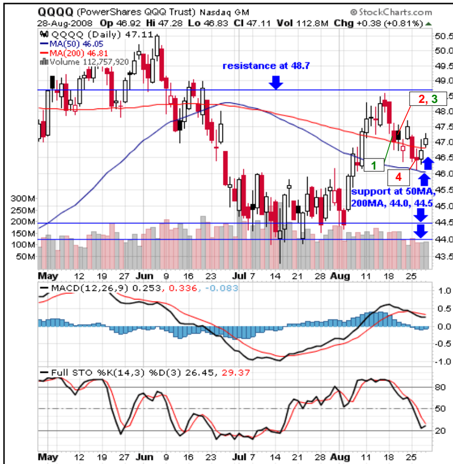
Chart courtesy of StockCharts.com