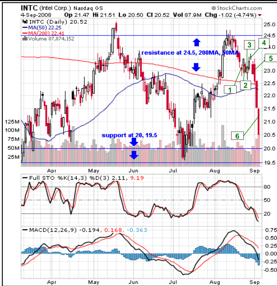
Chart courtesy of StockCharts.com